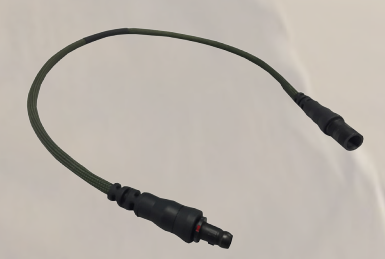
2M CONNECTOR BRAIDED CABLE NETWARRIOR ACCESSORY